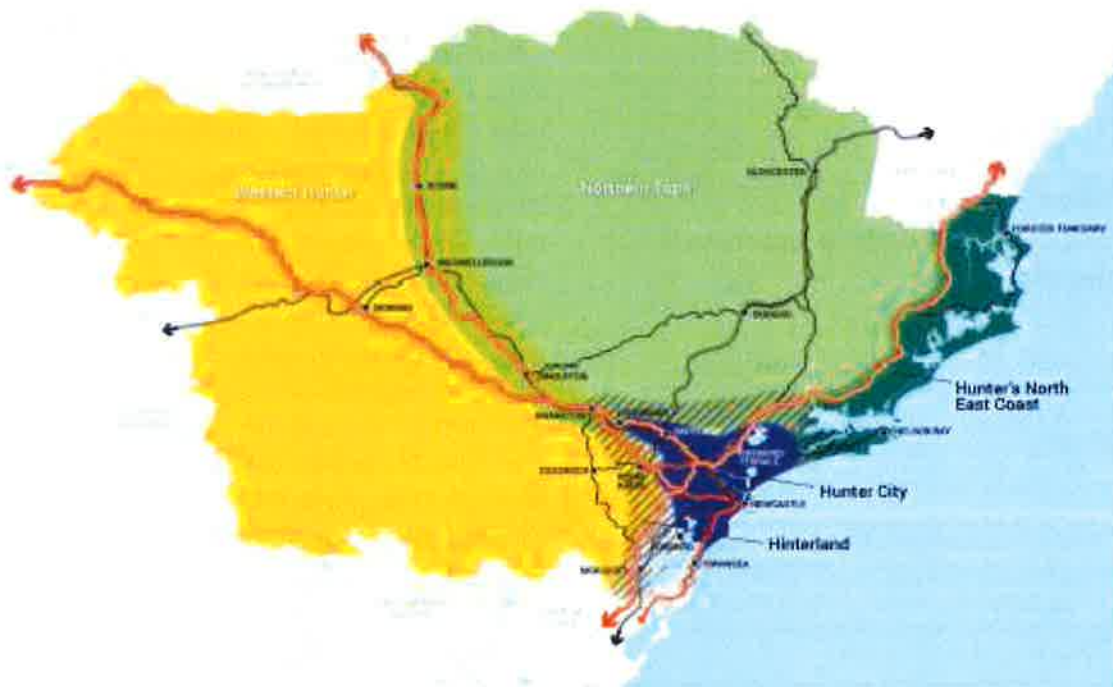
Figure 2: Landscape Subregions