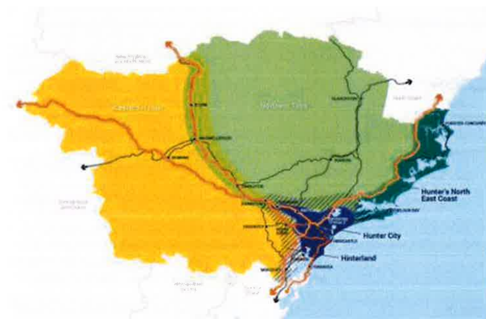
Figure 2: Landscape Subregions